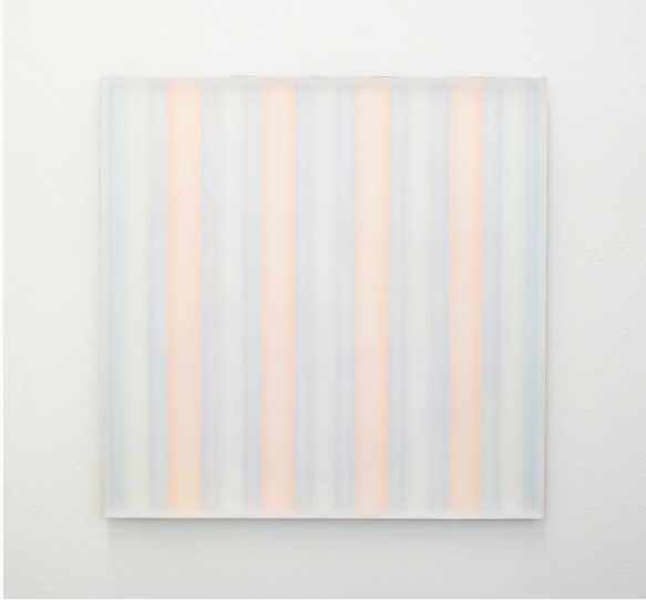
Otto, Ever Peek Ever , 47" x 47" acrylic over mixed media