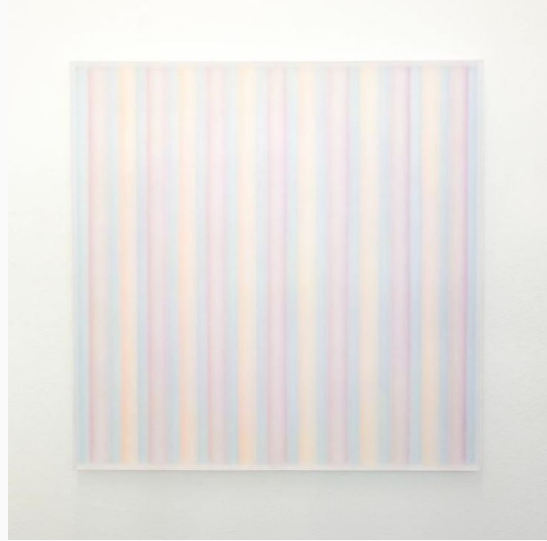
Otto, Ever Stay Ever , 60" x 60" acrylic over mixed media